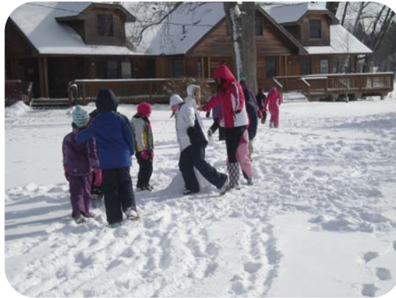
Youth group enjoying a winter retreat

Throughout the school year, Camp Onyahsa offers its facilities for picnics, retreats, parties, birthdays, weddings, reunions, school outings, Environmental Education classes, conferences, sportsmen, and business meetings. Site users may rent the camp for day, evening, or events. The camp site offers a scenic bay on Chautauqua Lake and a unique rustic hall.