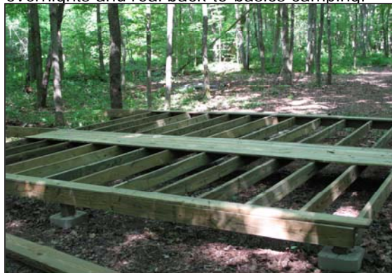
Tent platform construction in the Darrah Preserve

Onyahsa will add a new tent village to our site this summer. The "Algonquian Village" will be located in our 120-acre forest, the Darrah Nature Preserve, and will serve campers through overnight camp-outs. Local foundations are funding the construction of tent platforms and the acquisition of tents/flyes and bunk beds for this exciting project. It will be a great venue for village overnights and real back-to-basics camping!