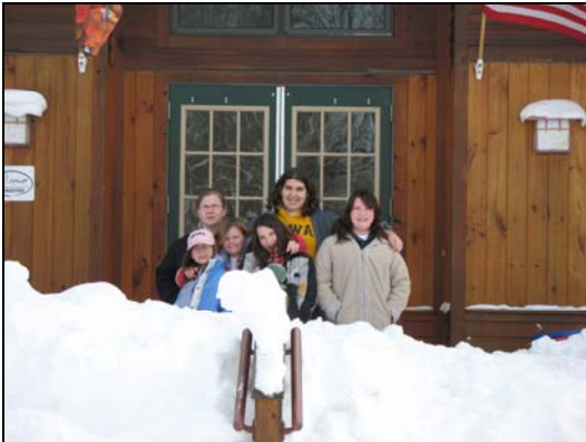
From winter white to green at Onyahsa!

Recycling bins will be placed throughout the Camp and the purchase of non-renewable disposable products (like plastic and Styrofoam) will be significantly reduced. Campers and site users can do their part by limiting the amount of similar items they bring to camp, recycling those they do, and reducing our energy consumption.