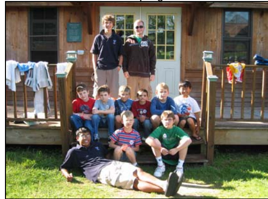
Our Promising Future

It's back ... the Onyahsa Promise Raffle. This year, this 50:50 raffle will be offered weekends at Camp or through the Business Office anytime. The cost will be $10/ticket and proceeds will fund Onyahsa operations. The winning numbers will be drawn on our final day of camp, and winners need not be present to win. Please contact the Business Office or visit Onyahsa Outfitters to buy your tickets! Thanks for keeping the Promise.