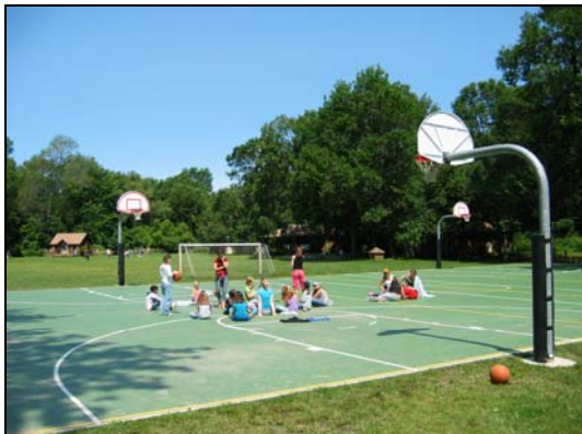
Order! ... Court is now in session!

We welcome summer and you back to Camp Onyahsa. After a busy spring, full of monthly camps, school groups, weddings, church retreats, and an Open House; Onyahsa is ready for its 109 th summer of great youth resident and day camping!