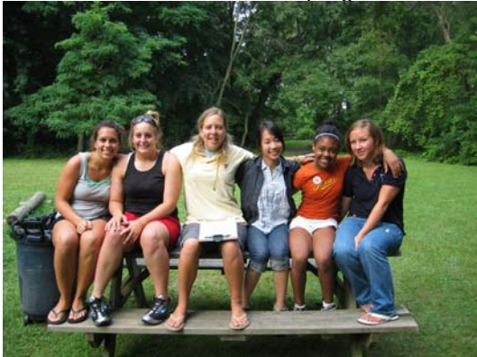
We're all about Fair Trade

The Trade limit is $720/camper, and these values will apply only to Traditional camp tuition. Contact the Camp Office for more details on our Tuition Trader program.