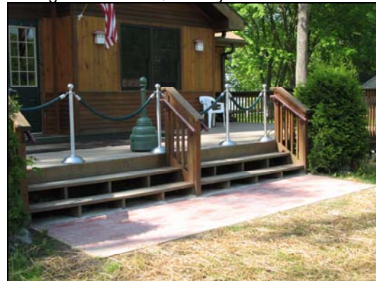
Follow the red brick road to our future!

Eventually, we will have a brick walkway to our main buildings from the parking area, and even to the flagpole. As we serve more individuals with disabilities, elderly visitors, and year-round participants, accessibility has become increasingly important. The engraved bricks cost $50 each and serve as a great permanent memorial. They may be ordered through the Business Office or, during the summer, at Onyahsa Outfitters.