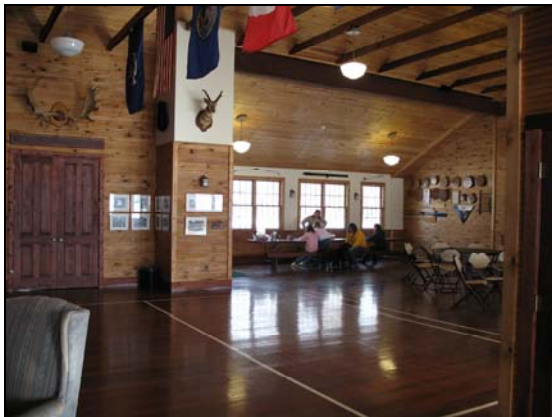
A result of our last Master Plan

To renew the Camp for the next generation and to ensure its future success, the Onyahsa Board is planning a major fund drive to coincide with this noteworthy anniversary. The goal of this drive will be to implement Onyahsa's long-term site development plan. Please stay attuned to this issue as it unfolds!