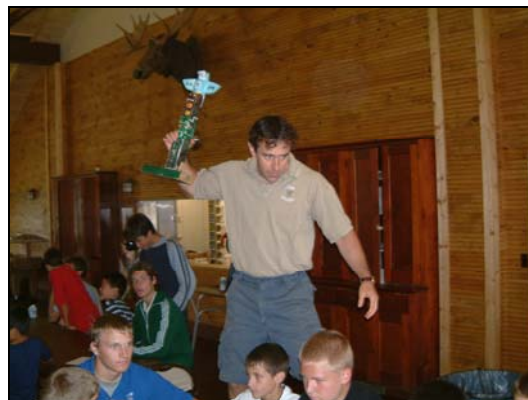
Alumni, re-connect or no Masahgwa for you!

Academy, Teen, and Leader-in-Training sessions. Day Camp in the Woods runs weekdays, 8:30am – 5:15pm, for eight weeks. More information is available at www.onyahsa.org . "Attention all campers, get ready to Go Global at Onyahsa this summer!"