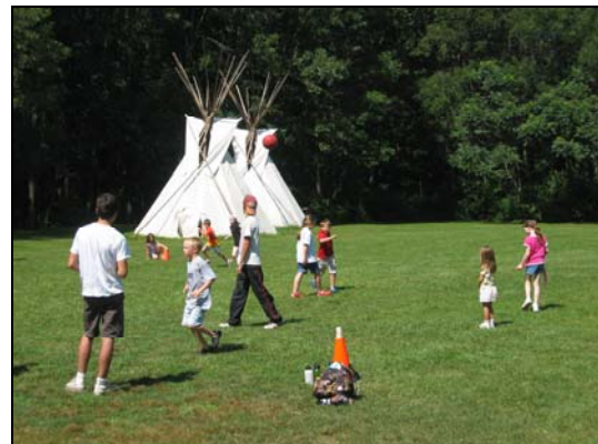
Send a Kid to Camp and make a difference!

To contribute, please contact the Camp Director or make a contribution by sending a check addressed to "Onyahsa Scholarship Program," to our Business Office.